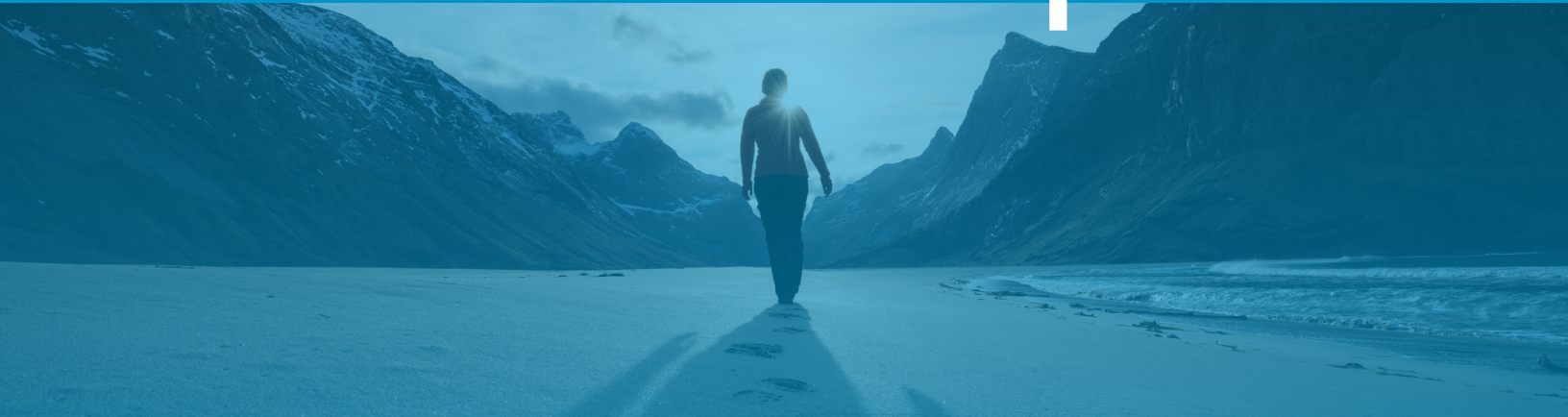
Exhibit at the Integrative Health & Medicine Conference of the Year A variety of booth & sponsorship options | In-Person and Online Past Virtual Events in Oct 2021 (800+) March 2021 (nearly 400) virtual attendees